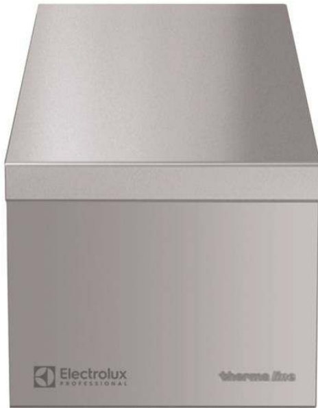
589154 (MCNABACOOO) Closed Work Top, one-side operated